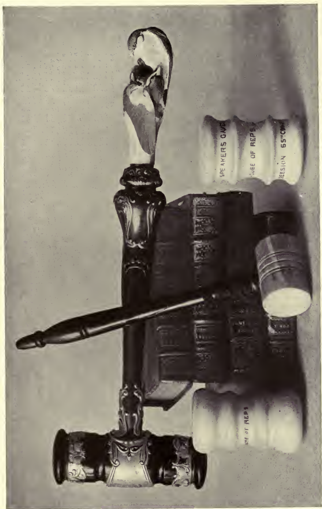
THE GAVELS USED BY MR. REED AS SPEAKER